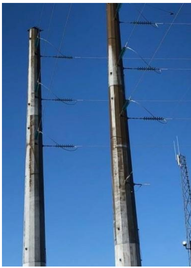
The attached photographs clearly demonstrate the extreme levels of protection of ZINGA over very protracted periods of time in highly aggressive ambient conditions.